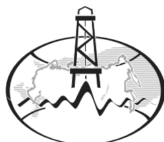
Ministry of Natural Resources and Environment of the Russian Federation

ISBN 978-5-9902432-1-7 ISBN 978-5-9902432-1-7