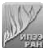
Severtsov Institute of Ecology and Evolution