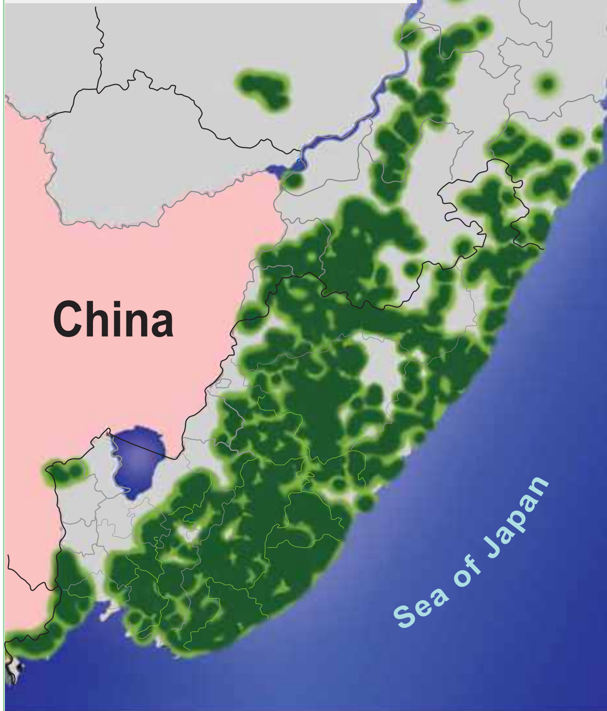
Figure 1: Distribution of the Amur tiger in Russia as indicated in the 2005 Census.